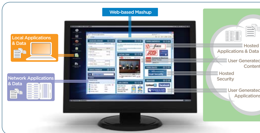
The changing desktop: Web mashups, user-generated content, widgets and hosted applications present new security challenges.

The dynamic, user-generated content common to Web 2.0 cannot be monitored with legacy security models, such as reputation databases or URL filtering. This presents IT security teams with conflicting challenges—how to tap the enormous potential of Web 2.0 while keeping networks, end-users, and sensitive data secure.